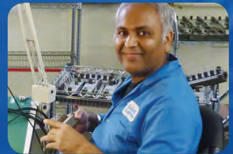
Rework & ECO Services

Quality and Responsiveness You Can Count On